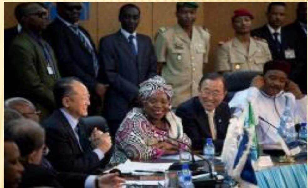
World Bank President Jim Yong Kim with African Union Commission Chairperson Nkosazana Dlamini Zuma, United Nations Secretary-General Ban Ki-moon, and President of Niger Issoufou Mahamadou in Niamey, Niger, during their Sahel trip in 2013.